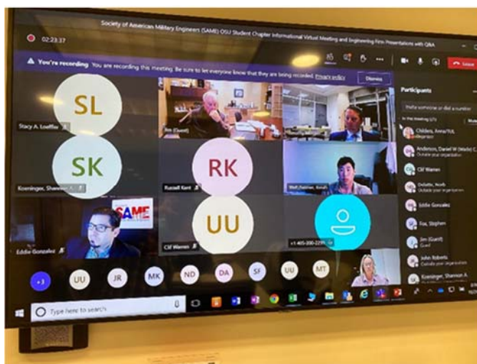
Meeting in a 2020 style! Screenshot of some of the participants.